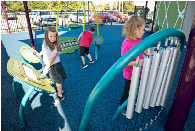
Sensory music components