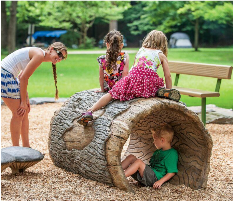
Crawl tunnel that resembles a hollow tree and fits the natural theme.