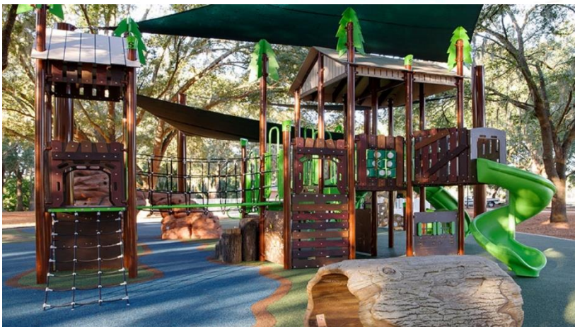
Wobbly Bridge connects two zones and nature theme.