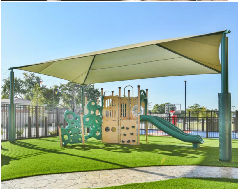
Padded four-post canopy