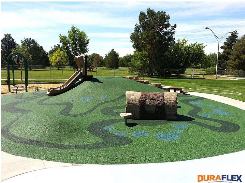
Example of poured-in-place rubber surfacing with nature-tone patterns and an accent color. As well as log crawl tunnel.