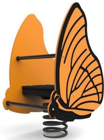
Freestanding spring riders with animal/insect theme