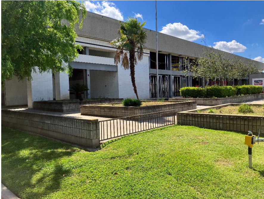
*Above: Actual building under construction – top stucco will remain