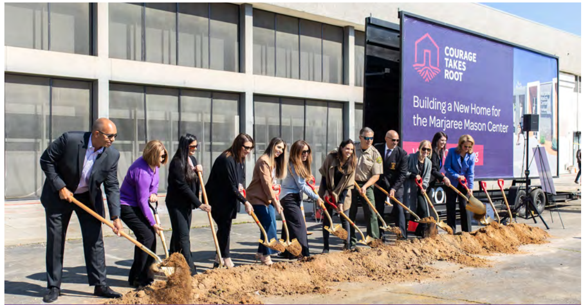
The Marjaree Mason Center breaks ground on a New Community Resource Center that's located at 255 W. Bullard Avenue in Fresno (between Blackstone and Maroa). It was formerly home to such educational institutions as Queen of the Valley, Heald College and The Milan Institute.

Your donation is an investment in more than just a larger physical space. It is an investment in thousands of adults and children whose lives will be transformed as the Marjaree Mason Center empowers them to move from fear and abuse to safety and stability.