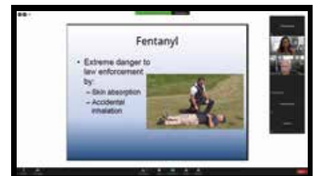
Virtual safety training