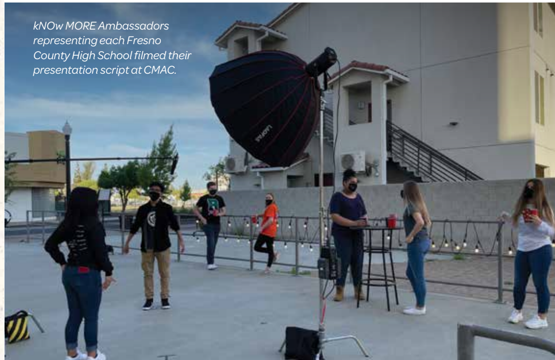
kNOw MORE Ambassadors representing each Fresno County High School filmed their presentation script at CMAC.