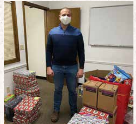
Fresno Police Department donates gifts to MMC clients and their children for the annual Trees of Hope gift registry.

Every year, through our holiday Trees of Hope program, our community purchases gifts for our clients and their children throughout all of our programs. In 2020, our community purchased gifts for more than 500 clients and their children.