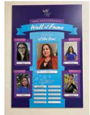
MMC Performance Wall of Fame

Training sessions in the last fiscal year include ACEs Aware Training, Situational Awareness Training, safety trainings and how to respond to exposure to opiates, especially fentanyl. Staff also contributed their ideas to brainstorming sessions in regard to their ideal new location for MMC.