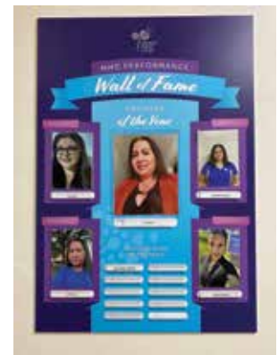
MMC Performance Wall of Fame

Training sessions in the last fiscal year include ACEs Aware Training, Situational Awareness Training, safety trainings and how to respond to exposure to opiates, especially fentanyl. Staff also contributed their ideas to brainstorming sessions in regard to their ideal new location for MMC.