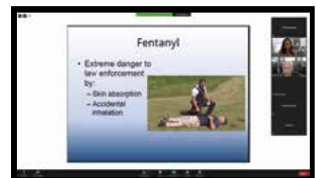
Virtual safety training