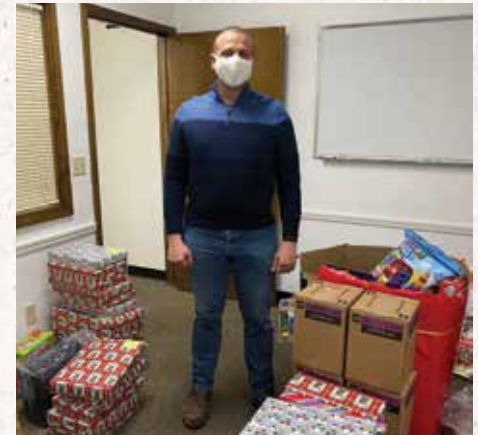
Fresno Police Department donates gifts to MMC clients and their children for the annual Trees of Hope gift registry.

Every year, through our holiday Trees of Hope program, our community purchases gifts for our clients and their children throughout all of our programs. In 2020, our community purchased gifts for more than 500 clients and their children.