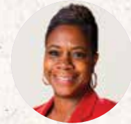
Carla Milton Community Health System